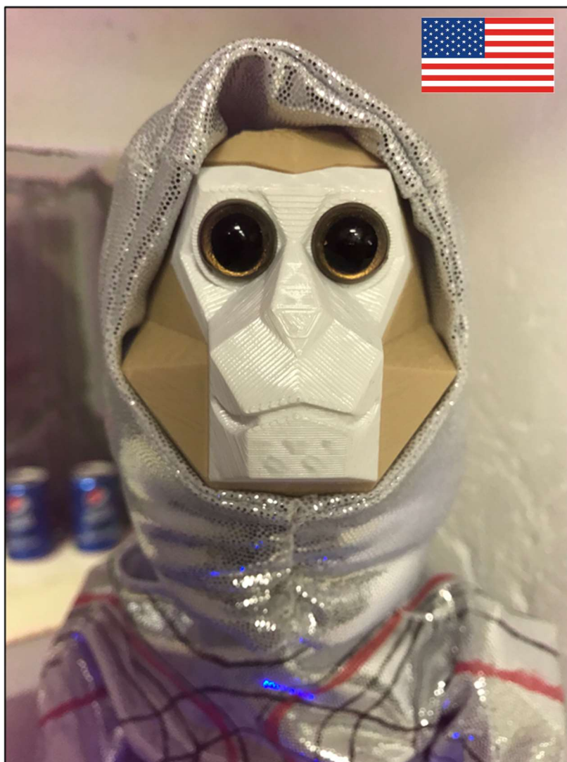
Cybernetic Simian Aeronaut HAM: High Altitude Robotic Monkey

When asked about his upcoming flight, it is rumored that HAM said he was excited to get back into the wild blue yonder and do the things he was printed to do!